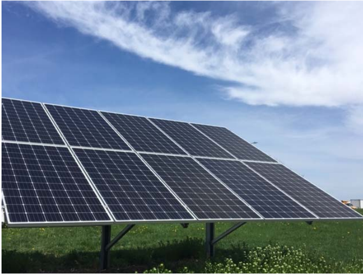
City of Saint Peter 4 kW Solar Program Saint Peter, MN